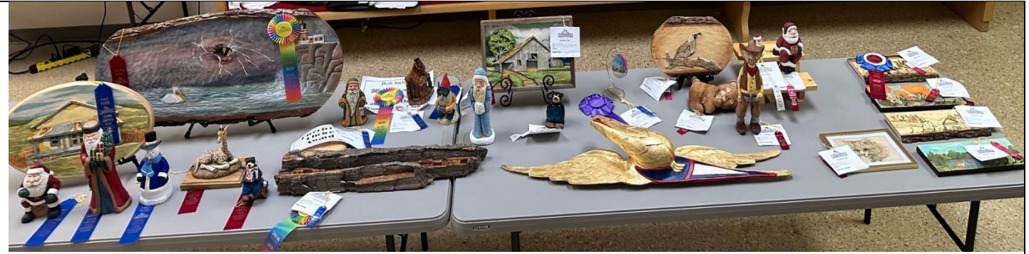
Empire State Fair Entries from Club Members